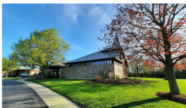
Carmel New Church Kitchener, ON 11 AM Sunday in person & online