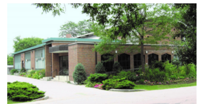
Olivet New Church Etobicoke, ON 10:30 AM Sunday in person & online