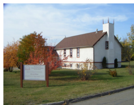
Dawson Creek New Church Dawson Creek, BC